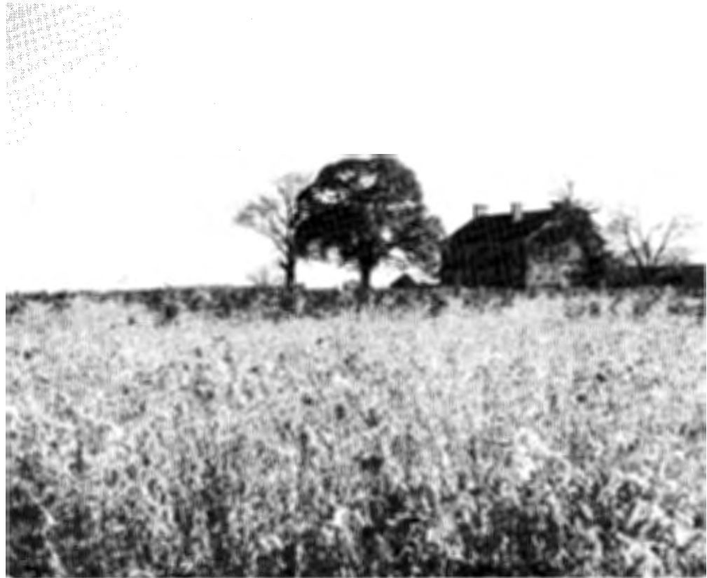
Farmland preserved through the PDC Program

The person who owns property in the Preservation and Agricultural areas has two basic options: the owner can develop the property