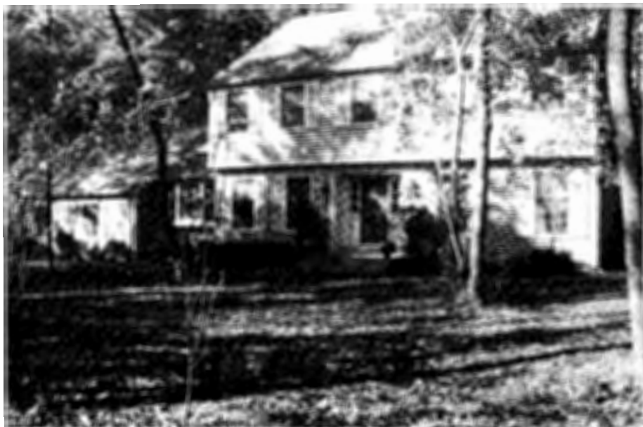
Home built with use of PDCs.

The Bank's successful resale of 52 rights in May 1990 was the culmination of a year's effort by the Bank and its staff. In August 1989 the Bank staff began drafting a set of regulations that would govern the sale of credits purchased by the Bank from Pinelands landowners and the Burlington County Pinelands Development Credit Exchange. By October 1989 the drafting team completed these regulations, and the Bank held a public hearing on them in Medford Township on December 14, 1989. The Bank's Board of Directors adopted the regulations on January 12, 1990.