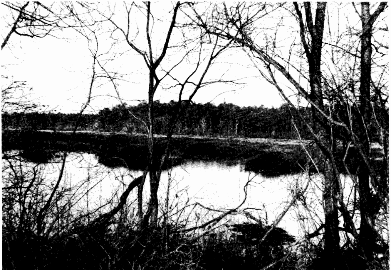
Pinelands Preservation Area

Please see details of Highlights beginning on page 4.